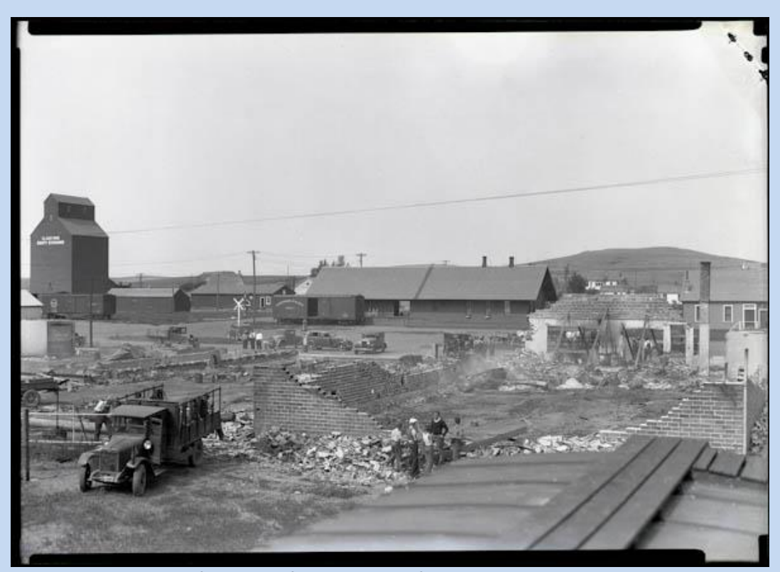
The aftermath of a devastating fire in 1933 in Gladstone.