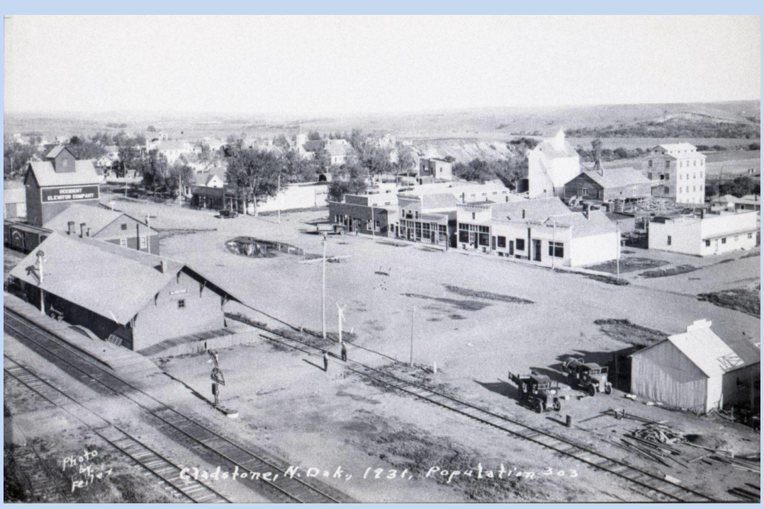
This 1931 image shows a bustling town with a roller mill, several grain elevators, downtown businesses and numerous residences.