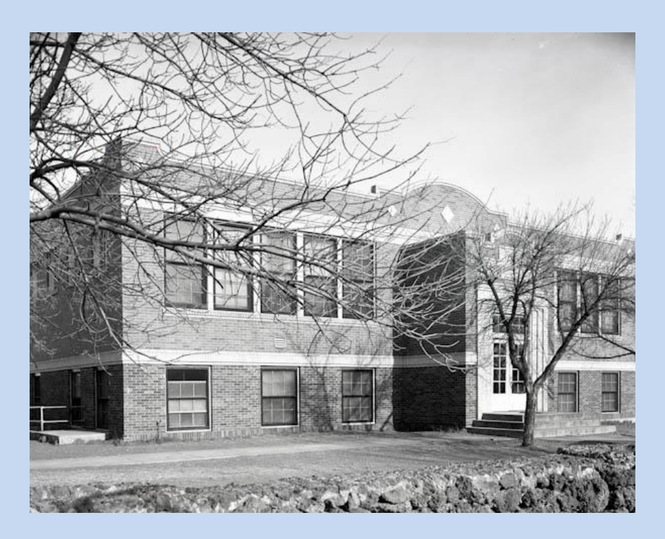
The Gladstone High School Building, 1955