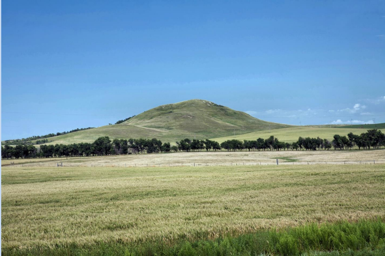
Campsite No. 7: Young Man's Butte

The information about the individual campsites located between Mandan and Dickinson was drawn from the book "Following the Custer Trail" by Laudie Chorne, as are the map illustrations. Chorne notes that the trail depicted in the maps is approximate, and intended for the reader to gain an understanding of the terrain through which the soldiers traveled. Many of the landmarks seen by the troops traveling the Custer Trail are visible from Old Highway 10 and Interstate 94.