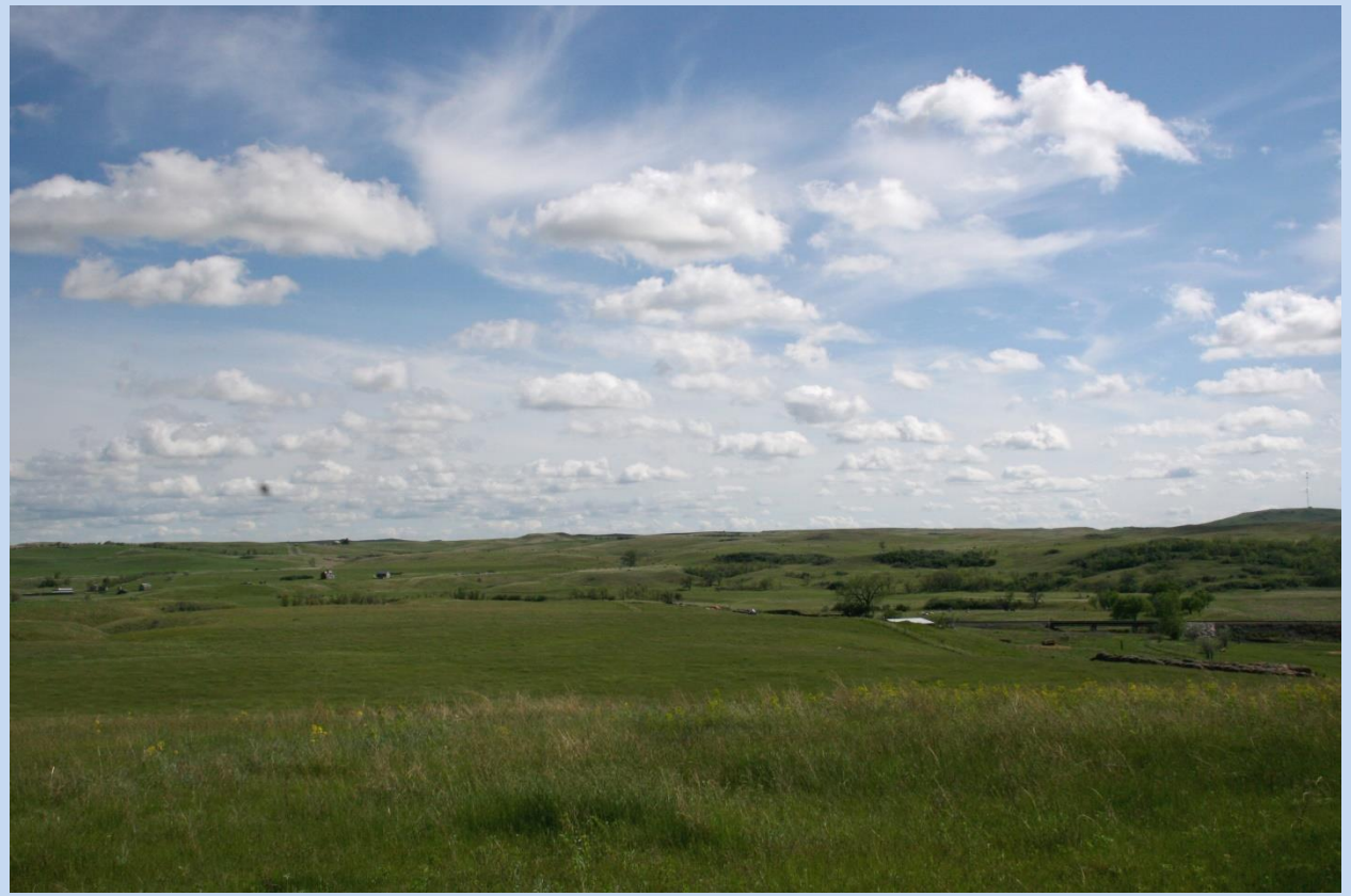
Campsite No. 2, Sweet Briar Creek photo taken May, 2015

The information about the individual campsites located between Mandan and Dickinson was drawn from the book "Following the Custer Trail" by Laudie Chorne, as are the map illustrations. Chorne notes that the trail depicted in the maps is approximate, and intended for the reader to gain an understanding of the terrain through which the soldiers traveled. Many of the landmarks seen by the troops traveling the Custer Trail are visible from Old Highway 10 and Interstate 94.