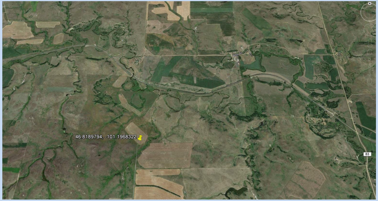
Aerial View of Campsite No. 2

The troops were roused at 2:40 a.m. and broke camp at 5:00. Before they could head west, however, they had to build a road to get the wagon train across the river. They departed camp at 8:00 a.m. By 1:45, after traveling nearly 11miles, they reached Campsite No. 3 on a plateau about 50 feet above Sweet Briar Creek. At about 3 p.m., a violent storm broke out bringing cold, heavy rain and abundant lightning. The storm did not last long, but dropped enough rain to soak the troops and make the ground muddy.