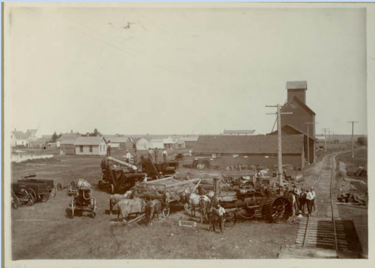
Unloading a steam engine at Taylor, 1901