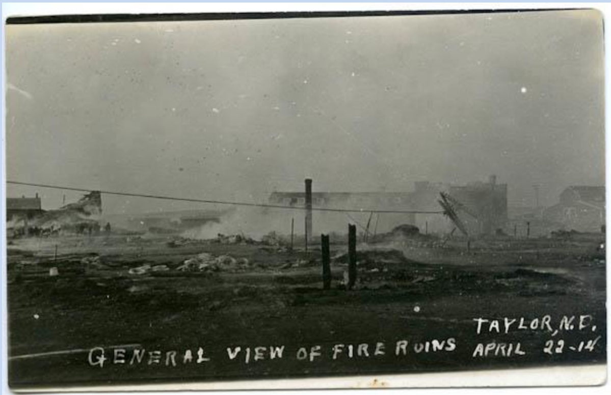
This real photo postcard shows the aftermath of a devastating fire that rampaged through Taylor in April of 1914.