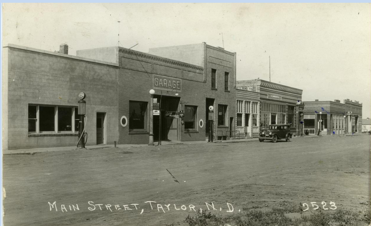
This view of Main Street in Taylor shows the garage with its Red Trail logos. Circa 1930.