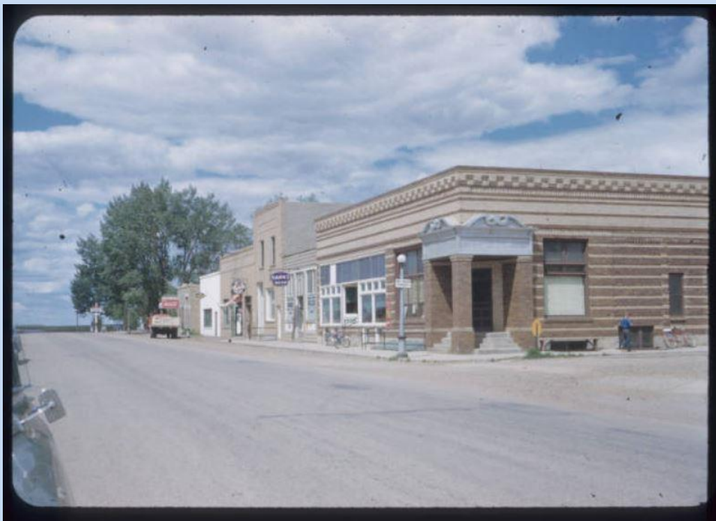
Population 300, Main Street, Taylor 1950s Photo credit: State Historical Society of North Dakota (2012-P-035-0030)