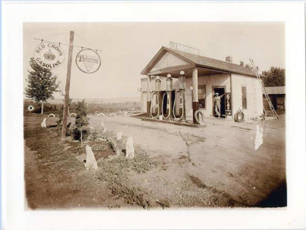
The exterior of the Dick's Station gas station in Taylor, owned by Dick Kickel.