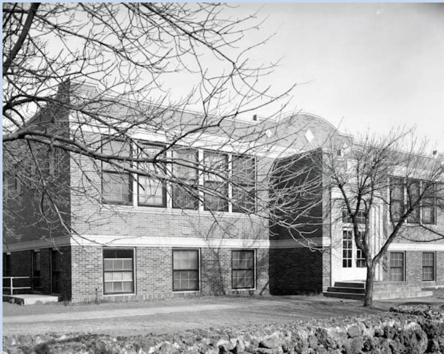
The Gladstone High School Building, 1955