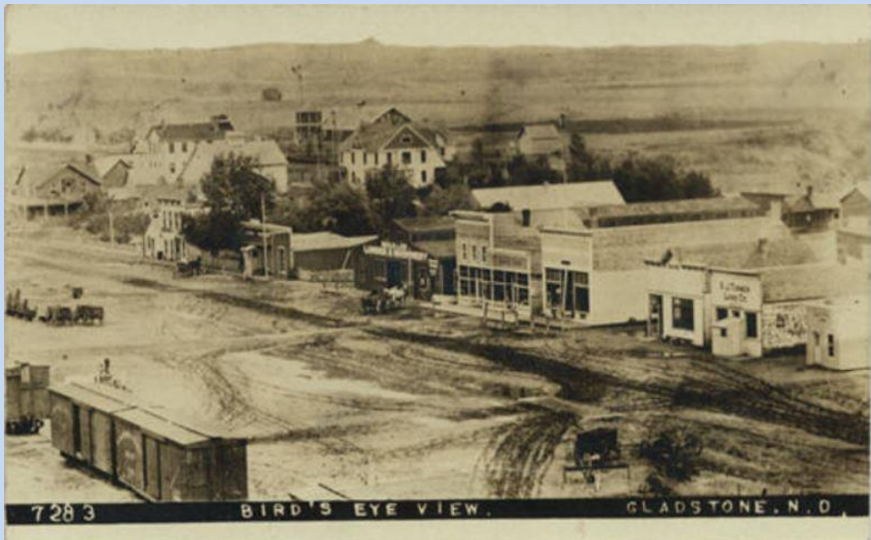
This real photo postcard shows an elevated view of Gladstone. Circa 1912.

Source: Stark County Heritage and Destiny