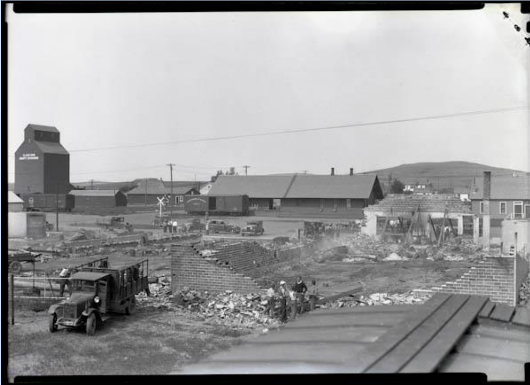
The aftermath of a devastating fire in 1933 in Gladstone.